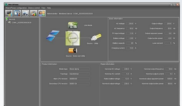
MONITORING SOFTWARE — WATCHPOWER

Parallel operation available now only on 4048MSP, special order required. Please contact us for more info.